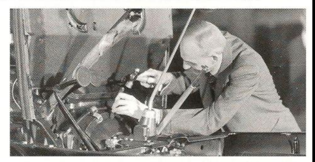
Henry Ford stamping *18-1* on March 10, 1932.

Engine # 243, produced on March 7, 1932, became *18-1*, the first serialized production V-8 engine. According to the engine log notes, it was sent to 'final assembly' the same day. In the Ford Archives photo above, dated March 10<sup>th</sup>, Henry Ford is shown hand stamping what is presumed to be this number on top of the transmission case of this engine at the Dearborn Assembly Plant. From this and other archive photos, it can be concluded that a Victoria body was installed on this chassis further down the assembly line.