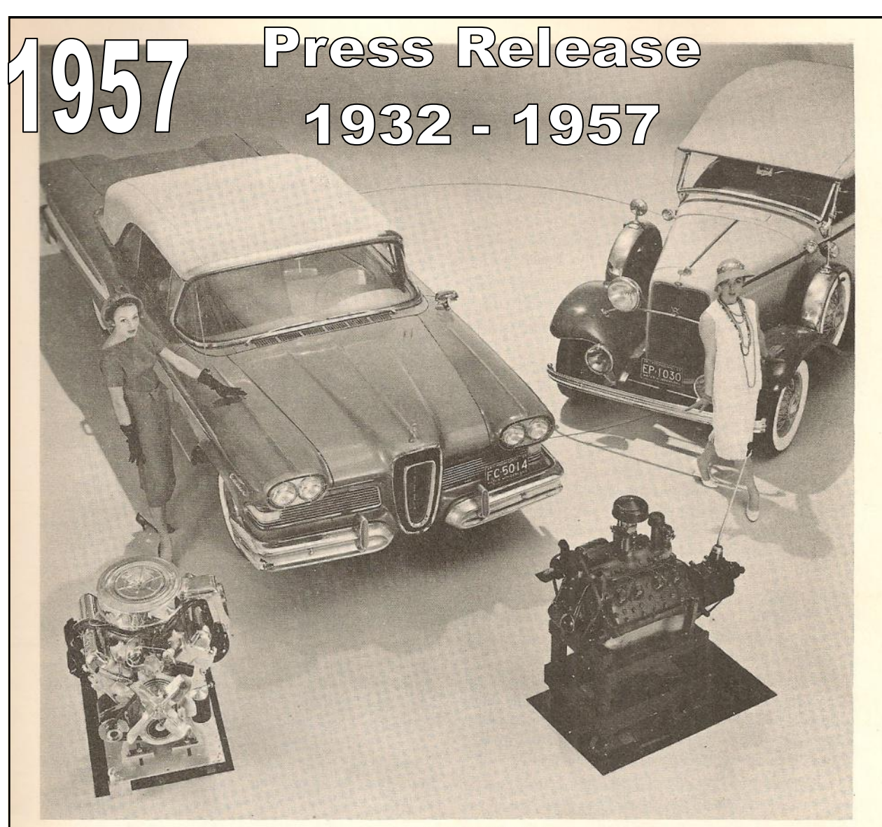
A 1957 NEWS RELEASE

"A quarter century of progress is illustrated in this photograph... engines, cars and fashions. The year 1932 is represented on the right by the first Ford V-8 engine, the model car it powered, and the young woman's attire. Today's counterparts are shown at the left... an Edsel E-475 of the type that will be assembled next Thursday as Ford Motor Company's No. 25,000,000 V-8 at the Lima, Ohio plant; the 1958 Edsel car; and an example of today's fashions." FORD MOTOR COMPANY NEWS DEPT. DEARBORN, DECEMBER 15, 1957.