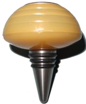
Bottle Stopper with Meet Logo