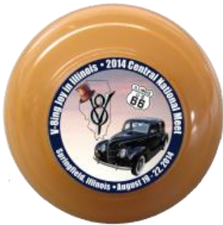
Gearshift Knob with Meet Logo